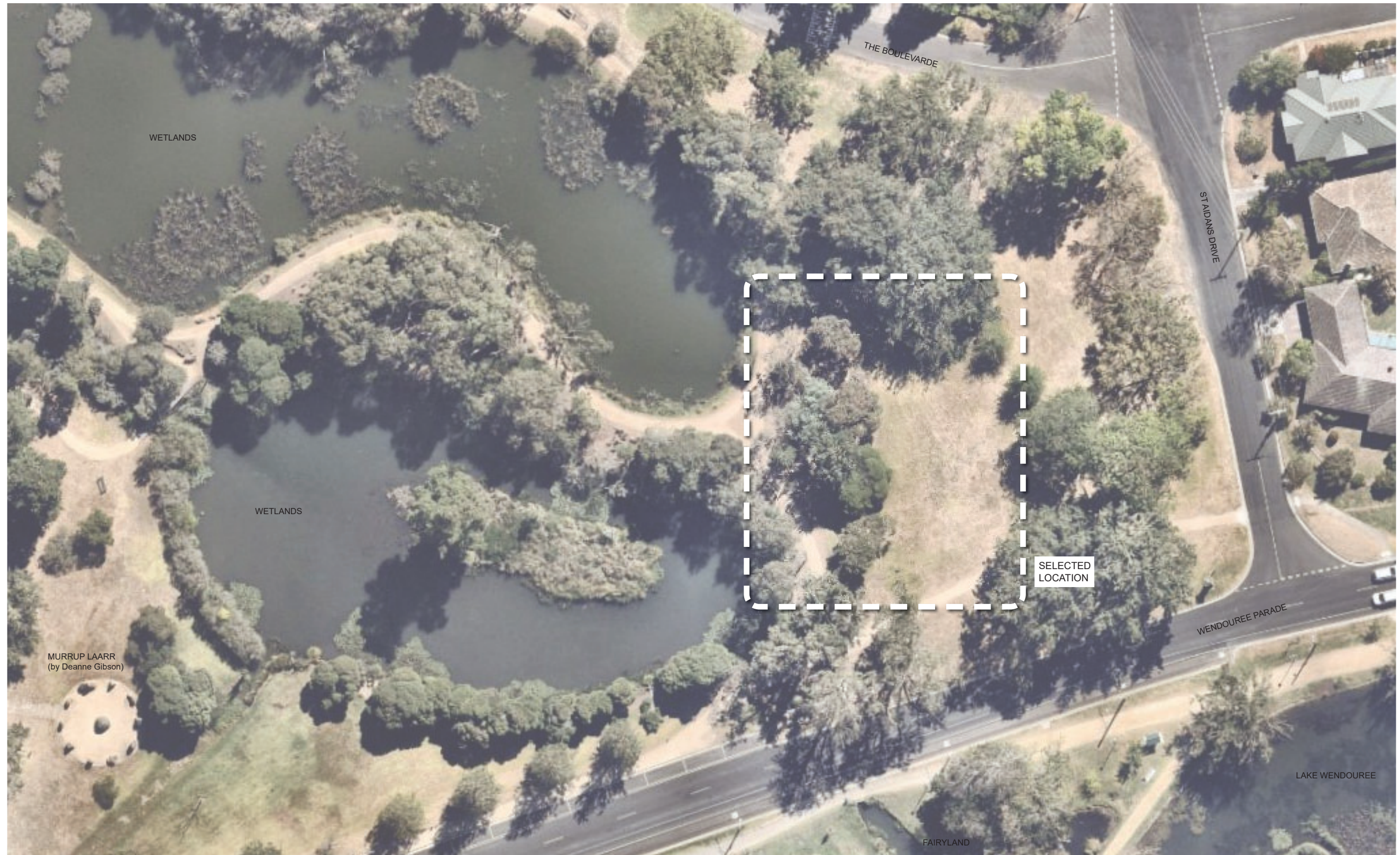
Figure 6: Site Map