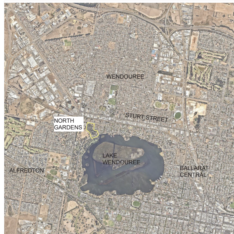
Figure 1: Context Map