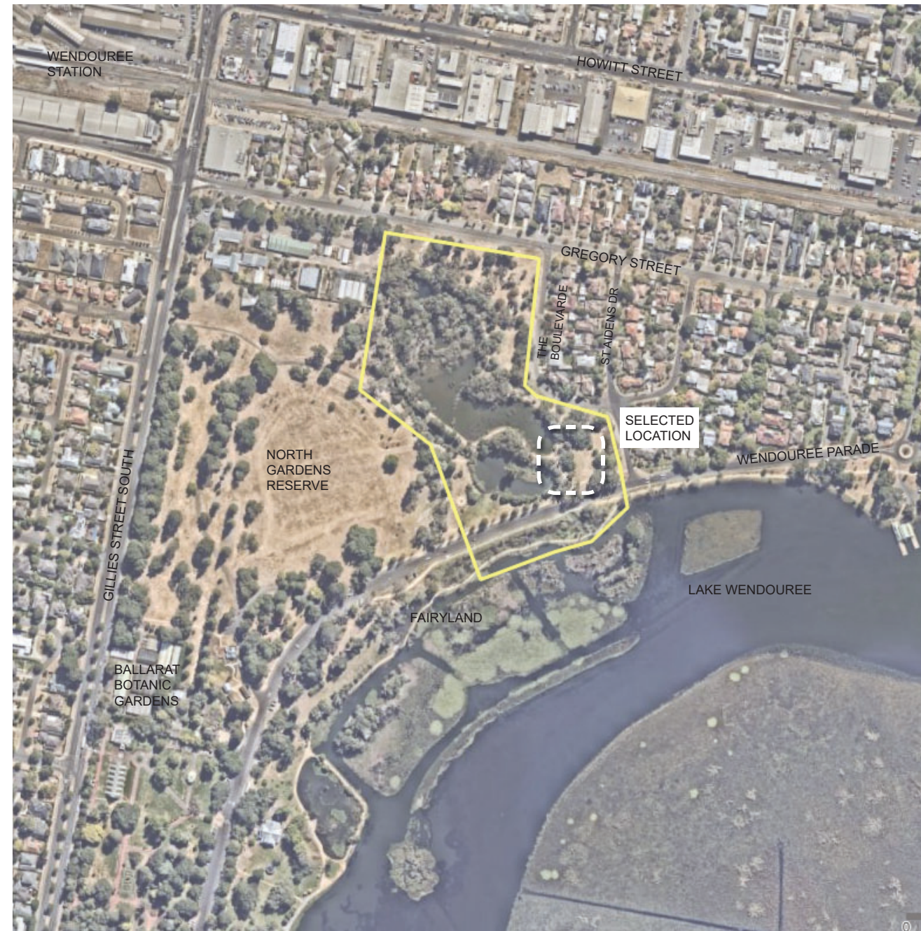
Figure 2: Site Map