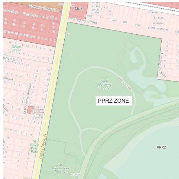
Figure 3: Zoning Map