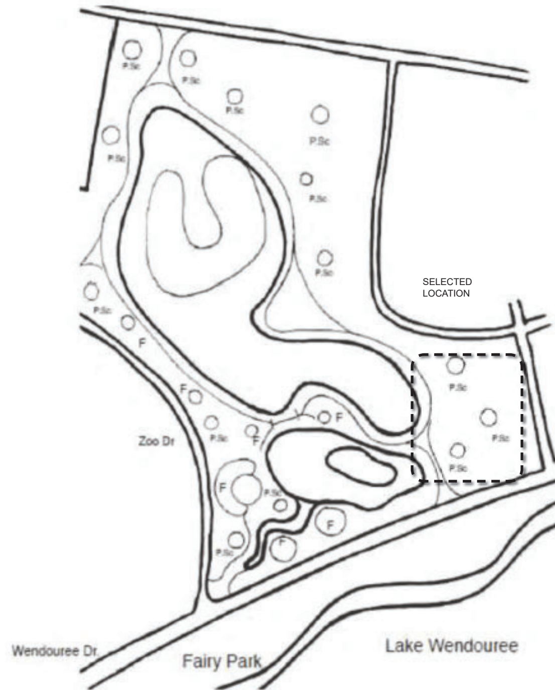
Figure 5: Possible locations for future artwork